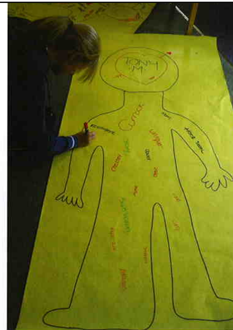
↑ Body Mapping

It is therefore vital that interventions offer opportunities to examine and redefine the self, to build an accurate positive sense of self as a basis for decision making. For young people, self esteem and body image issues are often associated with eating disorders.